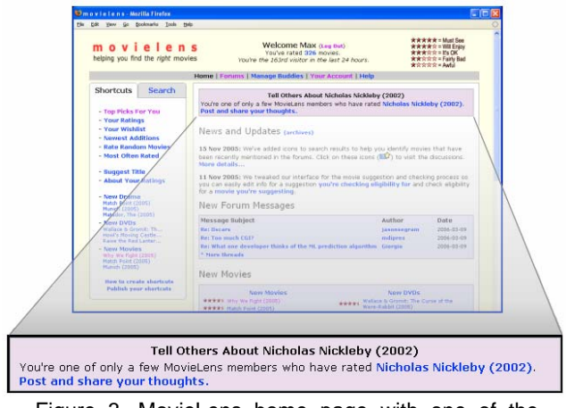
Figure 3. MovieLens home page with one of the invitation variants from experiment 1 (magnified).

Figure 3 shows an example of a personalized invitation on the MovieLens home page. The content selection algorithm ( Rare Rated , see below) has found a movie entity ( Nicholas Nickleby (2002)) that the target user has rated, but that few other users have rated. The invitation suggests that the user start a new thread about this movie, stating that the user is "one of only a few" members who is able to take this action.