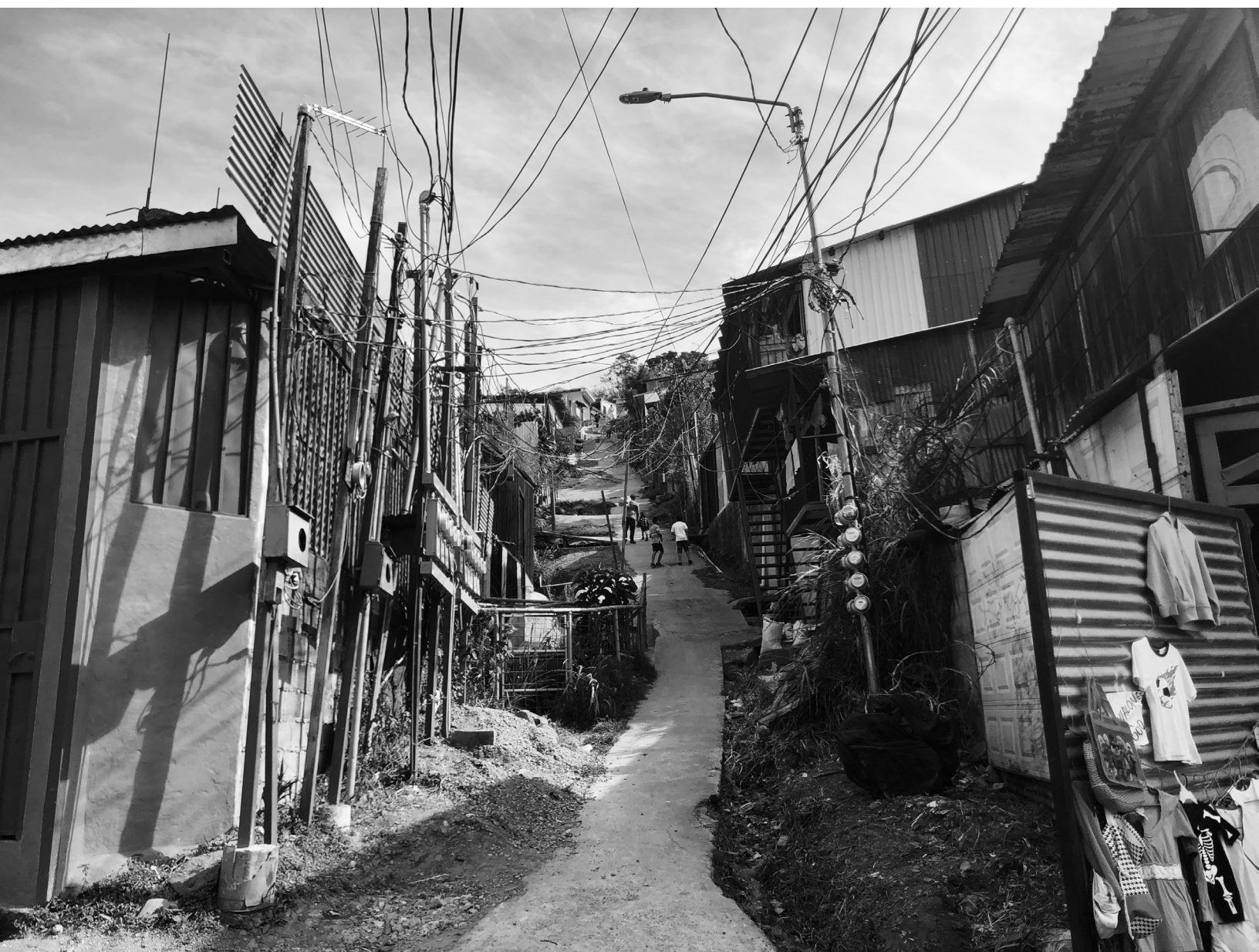
One of the alamedas of Calle Los Mangos