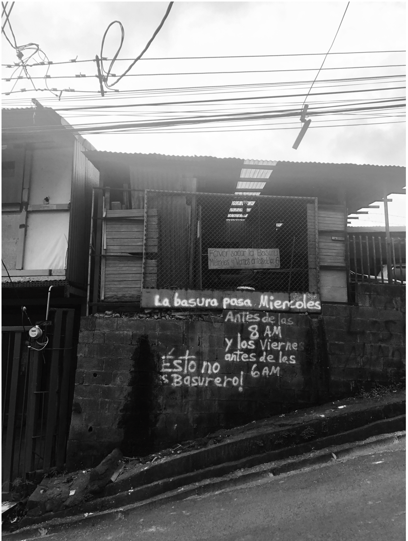
Signage in Calle Los Mangos