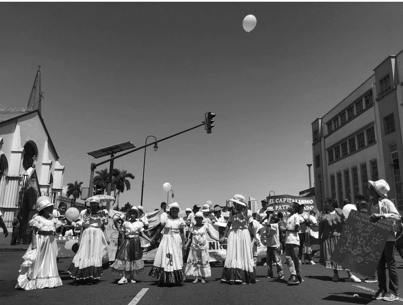
Vínculos at the Labor Day March