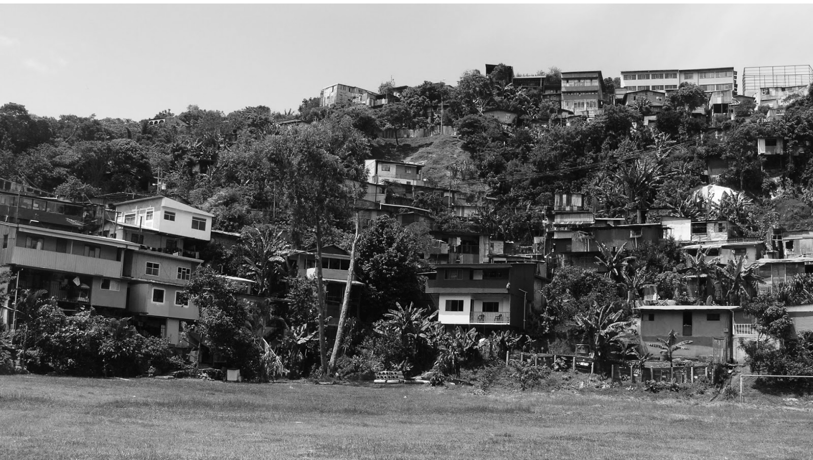
View of Río Azul