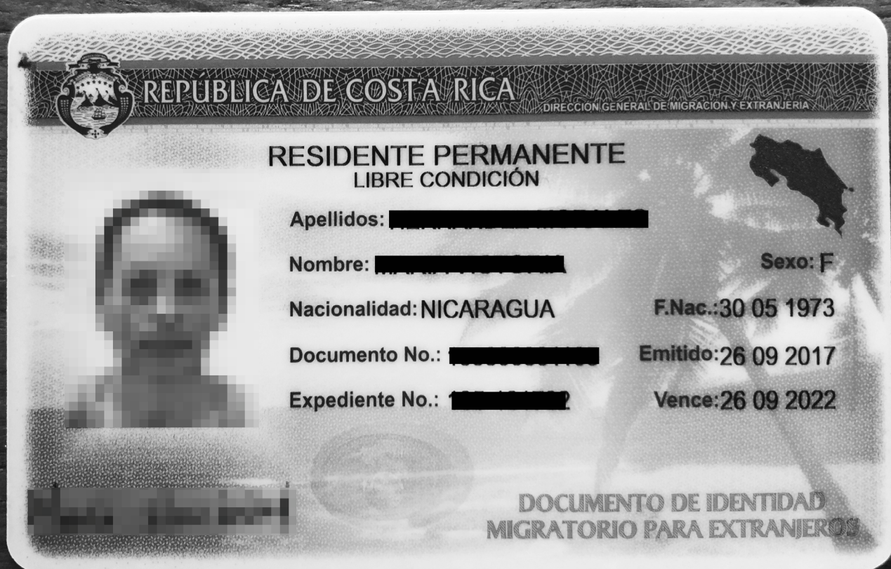
Example of a DIMEX card