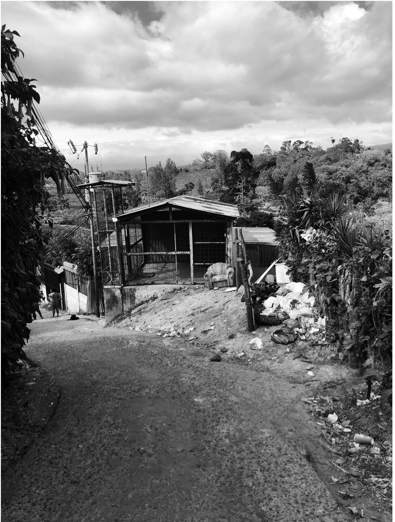
AyA Repumping Station of Calle Los Mangos