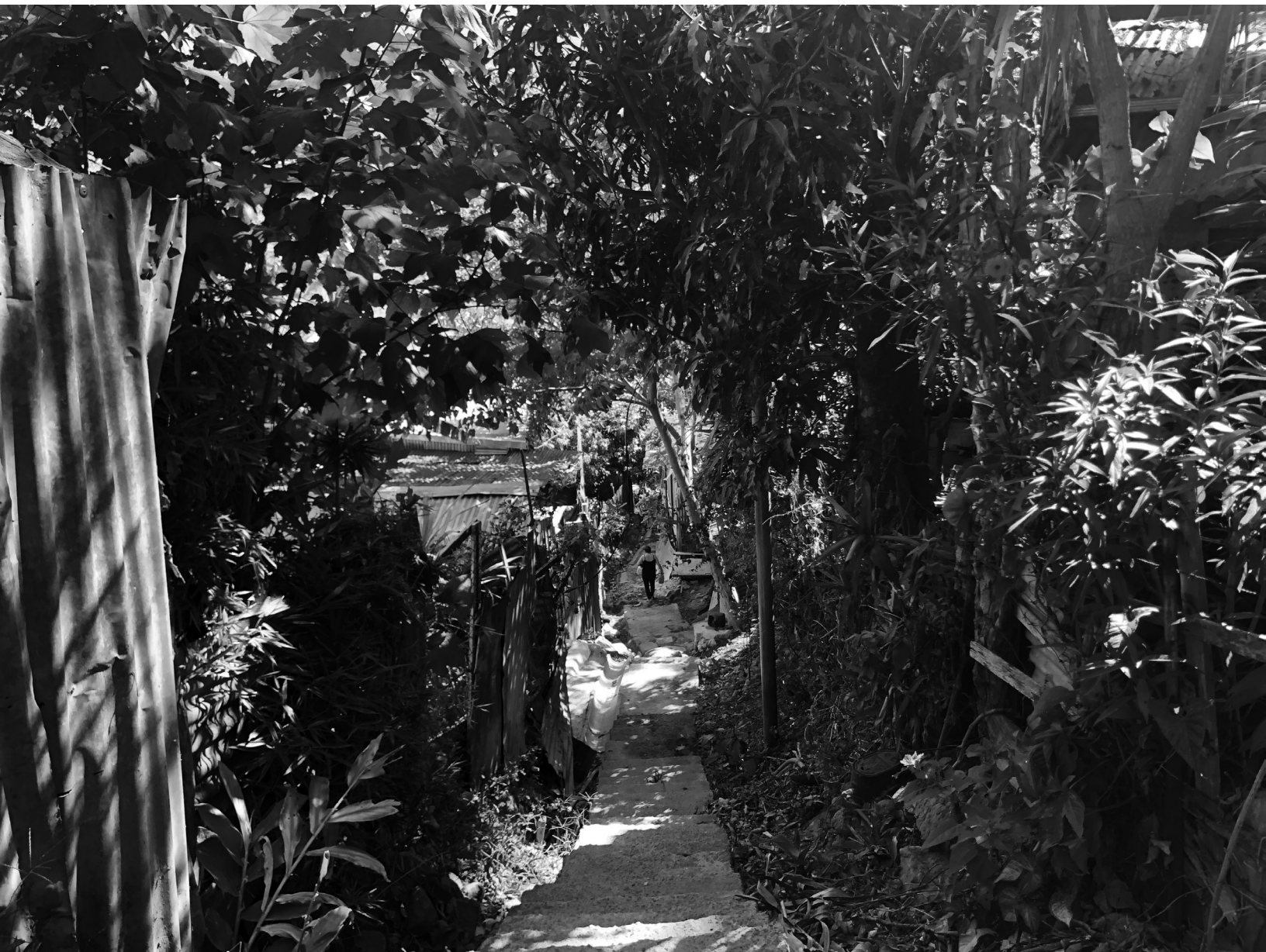
One of the many stairwells of Calle Los Mangos