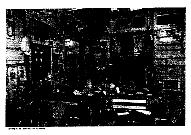
Figure 4.1 - Onboard the ISS (Commander Yuri Usachev, Expedition 2)

On a typical day (that does not involve EVAs) an ISS Crew member wakes up at 6.00 GMT and (after or before activities such as personal hygiene and breakfast) he or she reviews on a laptop computer the plan of the day. The scheduled activities include several sessions of physical exercises, communications with grounds, experiments and maintenance tasks. The crew executes these tasks by performing individual and collaborative activities, sometimes altering the order proposed by the mission planners, sometimes removing or inserting activities into the daily plan with or without previous coordination with Mission Control. At the end of their day, the astronauts tend to eat dinner together and then participate in some post-dinner activities such as watching a movie, reading a book, or writing personal emails.